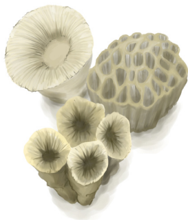
Fossil corals. After Linnaeus.