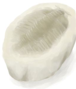
Fossil of a trilobite. After Linnaeus.

were physically adjacent represented a gradual transition. If A was located next to B, then one of them must originate from the other. This was why he so often confused cause and effect, or saw causal links where none existed. His ideas thus reflect a linear way of thinking. He believed, for example, that bedrock was formed from hardened gravel, and that clay containing shells turned into limestone.