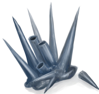
A crystal. After Linnaeus.

west of the country were to be of significance for the development of stratigraphic geology.