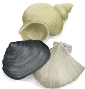
Shells. After Linnaeus.